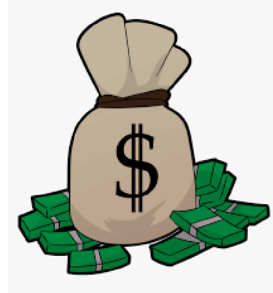
VA Office of Budget