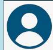
TBD MidCon (VISN 10, 12, 15, 23)